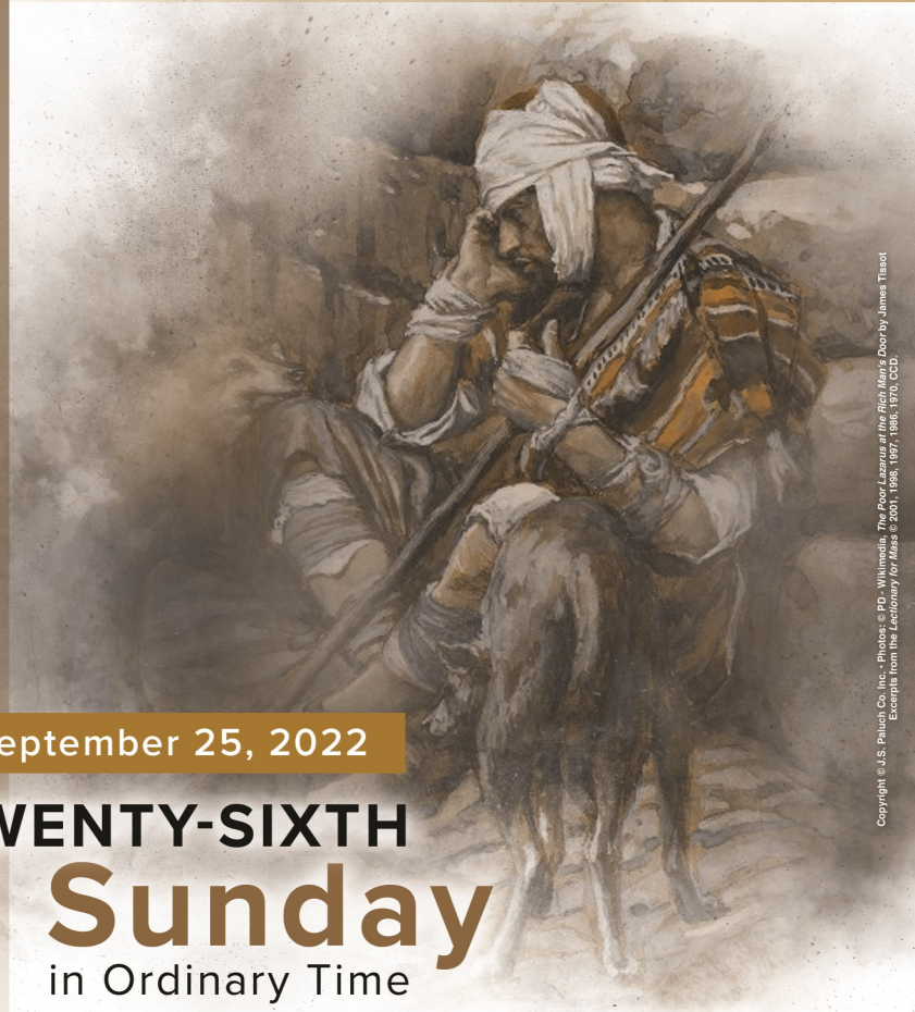
Copyright © U.S. Paruch Co., Inc. - Photos © PD, Wikimedia. The Poor Lazarus at the Rich Man's Door by James Tissot. Excerpted from the Lectioary for Mass © 2001, 1998, 1997, 1986, 1970, CCD.