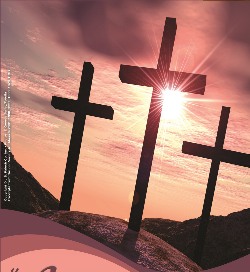
Copyright © J.S. Paluch Co. Inc. Excerpted from the Lectionary for Mass © 2001, 1998, 1997, 1986, 1970. CCD.

4839 S. Harding Ave. Chicago, IL 60632 773-847-0697/773-847-1620 - Fax