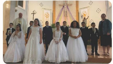
First Holy Communion