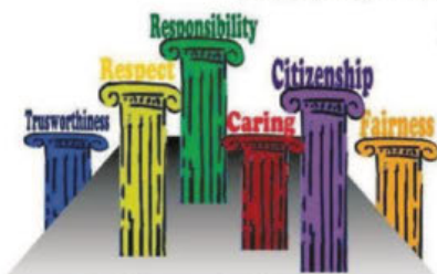
6 Pillars of Character

Students were honored in recognition of their exemplary character demonstrated both inside and outside the classroom throughout the month of February. Their positive influence enriches our school environment and inspires their peers. Their dedication to upholding these values sets a shining example for the entire school community. Congratulations!