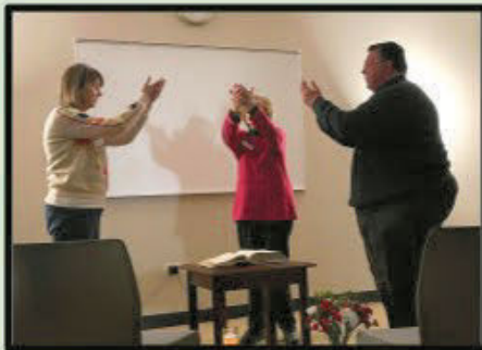
Simulating a SPRED Mass