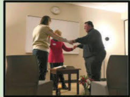
Simulación de una Misa de SPRED