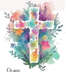
On your First Reconciliation

Please keep our second graders in your prayers as they continue their faith journey, learning that they are deeply loved, always forgiven, and forever part of God's flock.