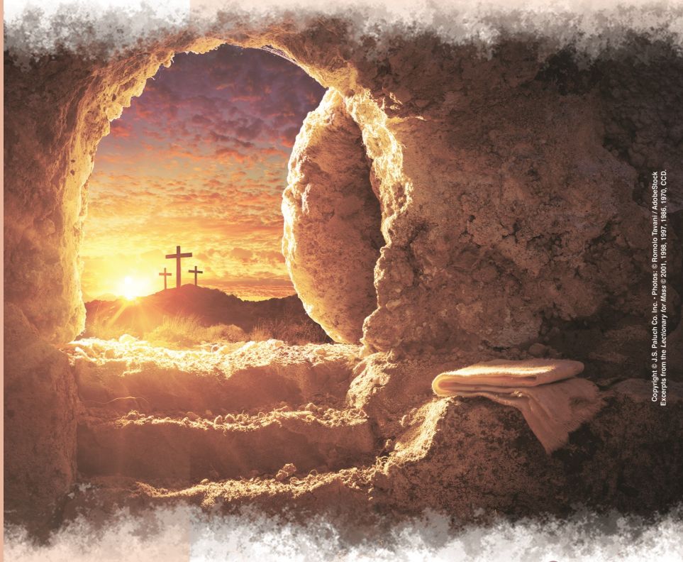
Copyright © J.S. Paluch Co. Inc. - Photos © Romano Trenti / AdobeStock Excerpts from the Lectio for Mass © 2001, 1998, 1997, 1986, 1970, CCD.