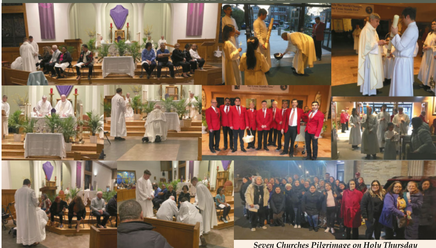
Seven Churches Pilgrimage on Holy Thursday