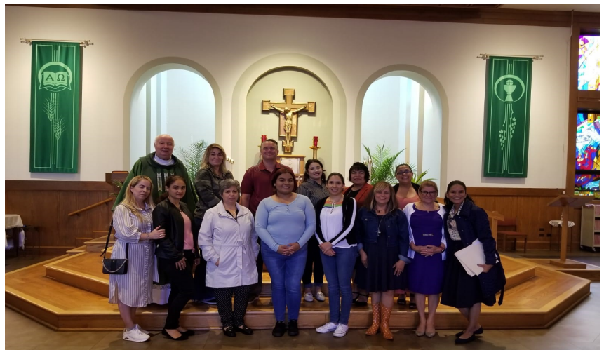
Sts. Bruno & Richard Parish Catechists on Catechetical Sunday. Thank you catechists for all that you do!

Tickets can be purchased from the parish office, after masses, or from a CCW board member.