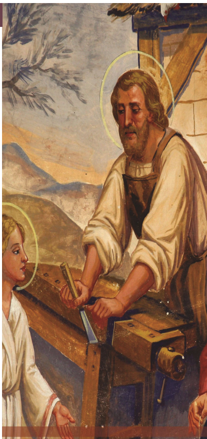
ST. JOSEPH THE WORKER

Glorious St. Joseph, you are the pattern of all who work. Obtain for me, please, the grace to work conscientiously and to put devotion to duty before my selfish inclinations. Help me to labor in thankfulness and joy, for it is an honor to employ and to develop by my labor the gifts I have received from almighty God. Grant that I may work in orderliness, peace, moderation and patience without shrinking from weariness and difficulties. I offer my fatigue and perplexities as reparation for sin. I shall work, above all, with pure intention and with detachment from self, having always before my eyes the hour of death and the accounting which I must to render of time ill-spent, of talents unemployed, of good undone, and of empty pride in success, which is fatal to the work of God. For Jesus through Mary, all in imitation of you, good St. Joseph. This shall be my motto in life and in death. Amen.